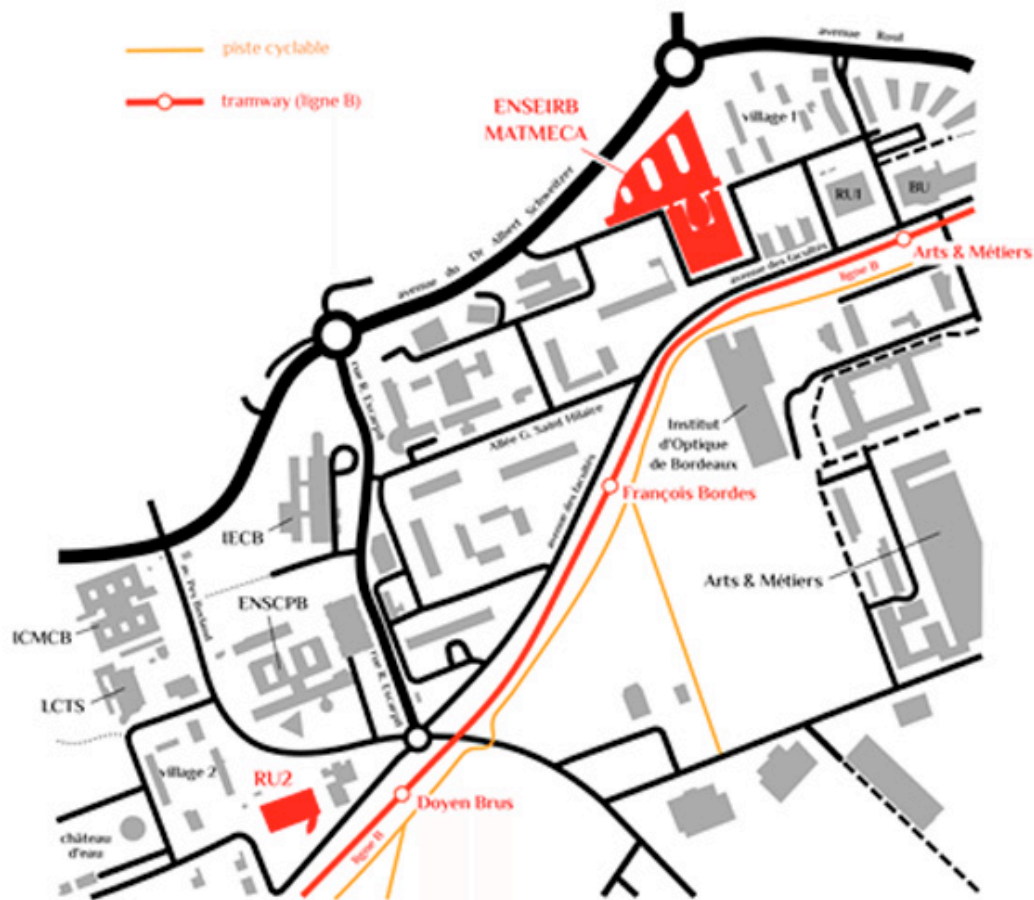
Plan du campus